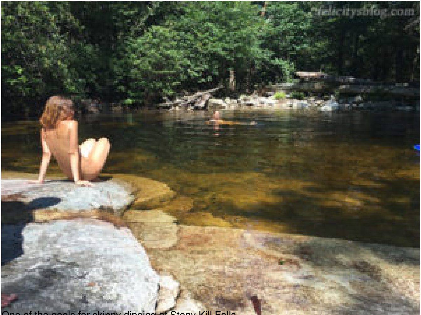
One of the pools for skinny dipping at Stony Kill Falls