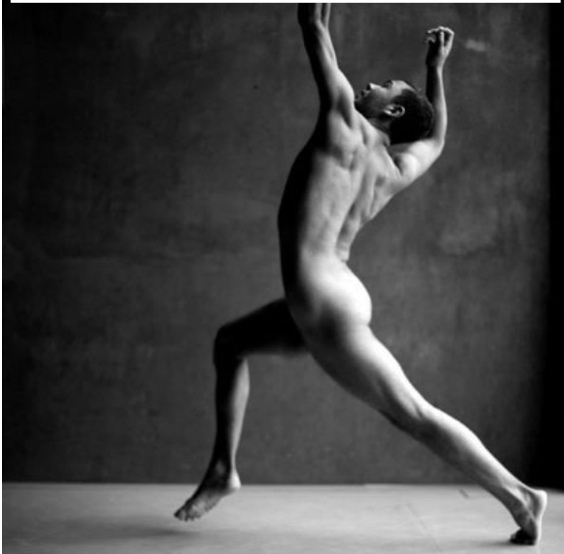
“Nude” nudist men’s group in NYC

Go Naked – This is another new social group that caters to men, but has also organized all-gender gatherings. Events take place in NYC and Philadelphia, and include naked dance / bar socials. More info at https://www.gonaked.co .