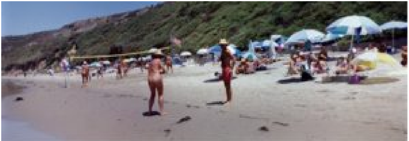
Nude section at Bates Beach

The beach was once a safe, family-friendly environment that attracted several hundred people on summer weekends. On the convenient eastern end, people in bathing suits came to exercise their dogs and watch the world-class surfers practice their skills. The more remote western end served many people who enjoyed a clothing-optional beach experience. These traditional uses of the beach served the public well for over 40 years.