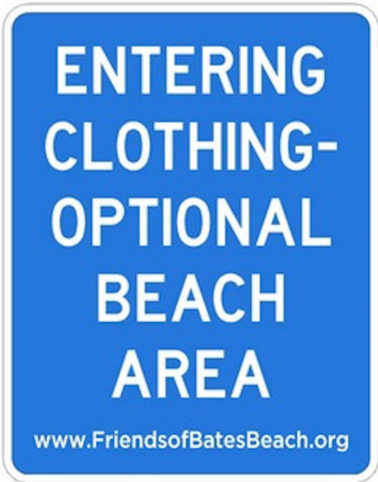
New sign by Friends of Bates Beach: "Entering Clothing-Optional Beach Area"