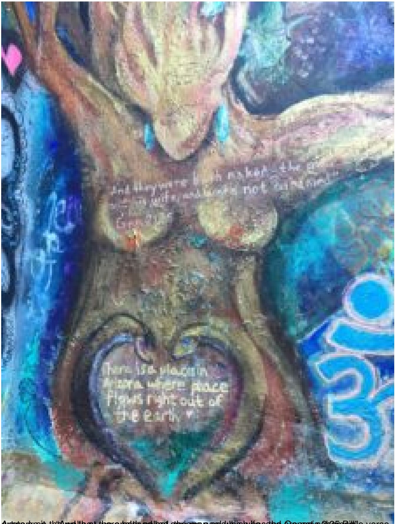
Quote from the walls at Verde Hot Springs, a place where peace flows right out of the Earth. The quote is a reference to the Genesis 2:5 Bible verse.