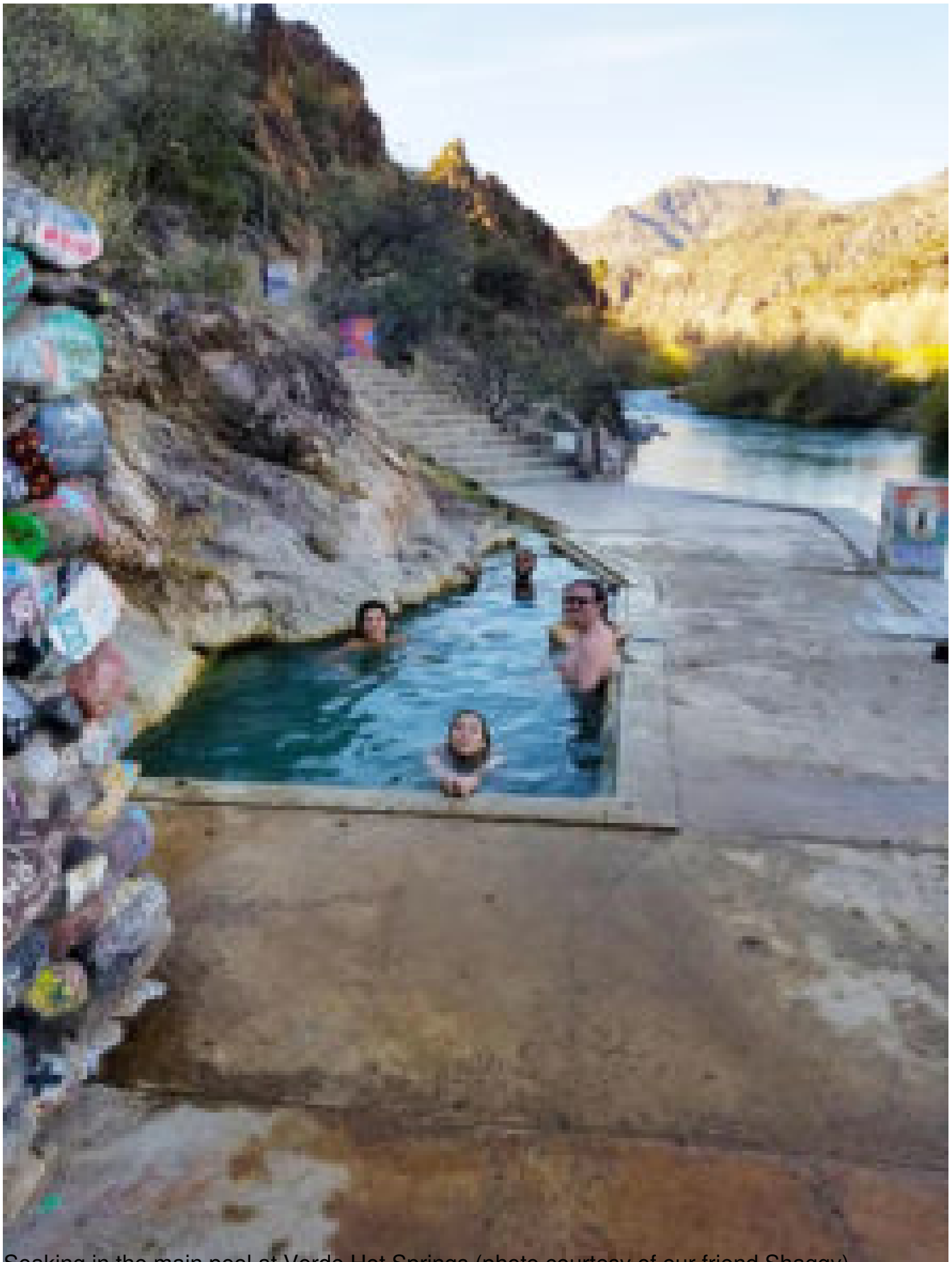
Soaking in the main pool at Verde Hot Springs