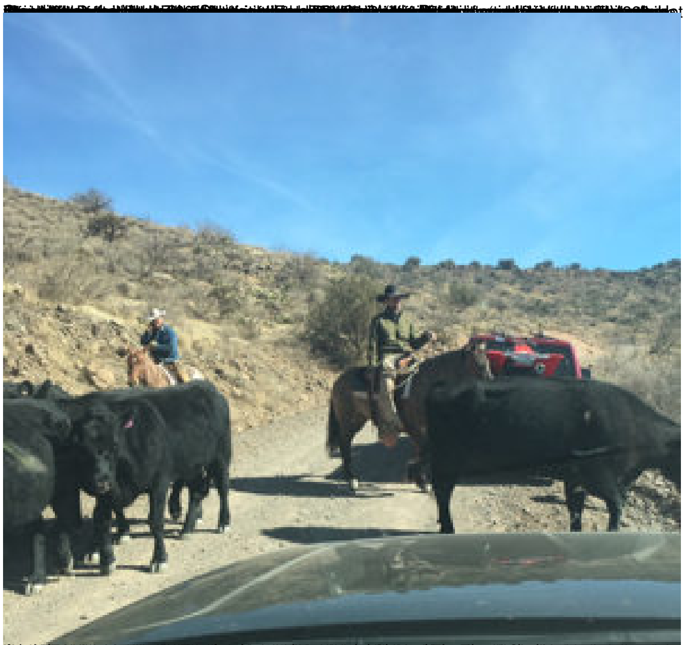
At Verde Hot Springs, Arizona, a herd of black cattle is being driven across the dirt road by two riders on horseback. The scene is set in a desert landscape under a clear blue sky.