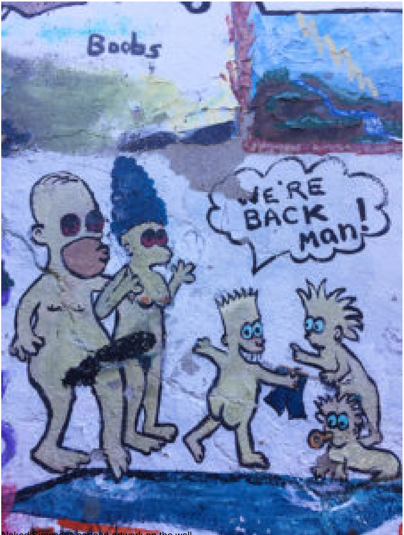
Naked Simpsons cartoon artwork on the wall