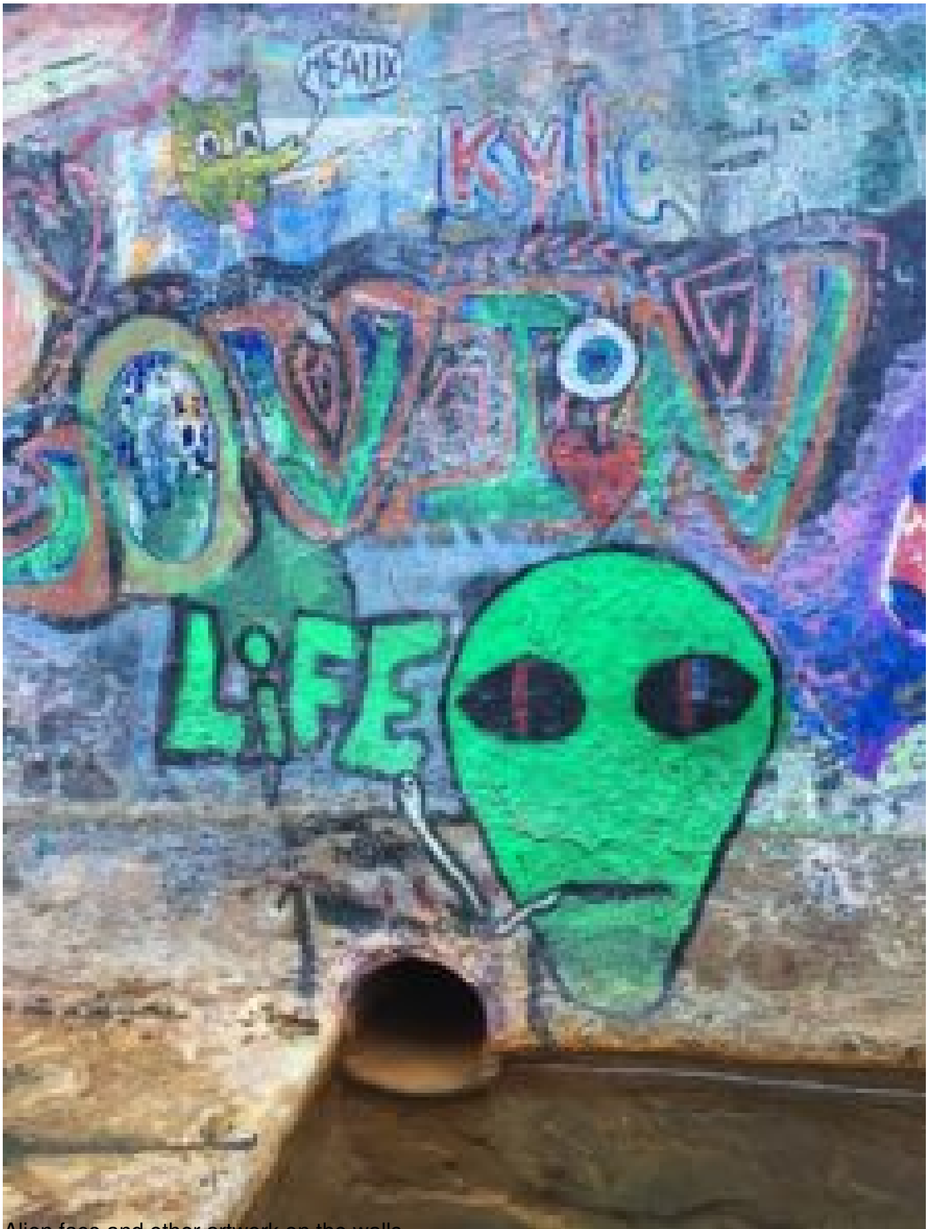
Alien face and other artwork on the walls