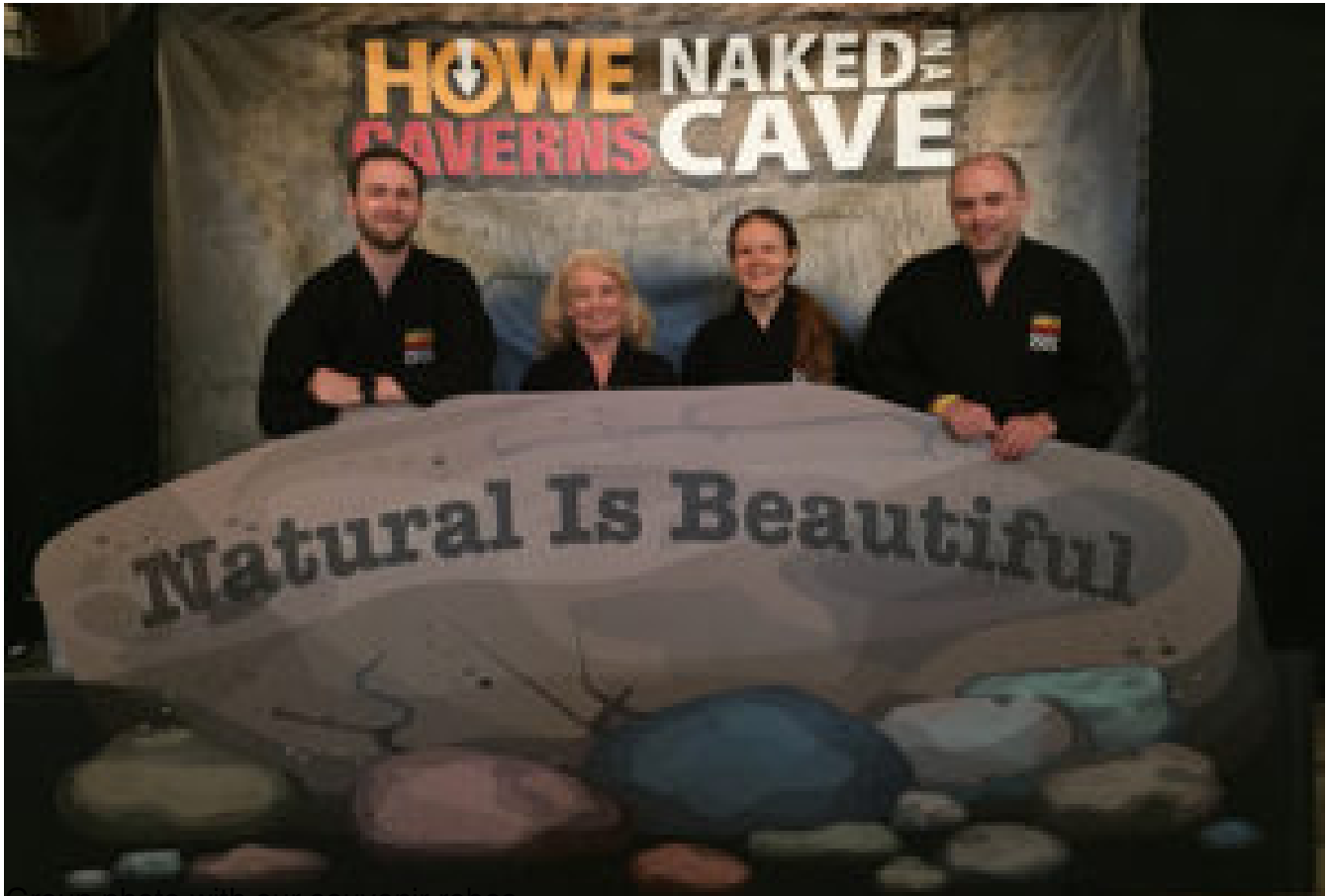
Group photo with our souvenir robes