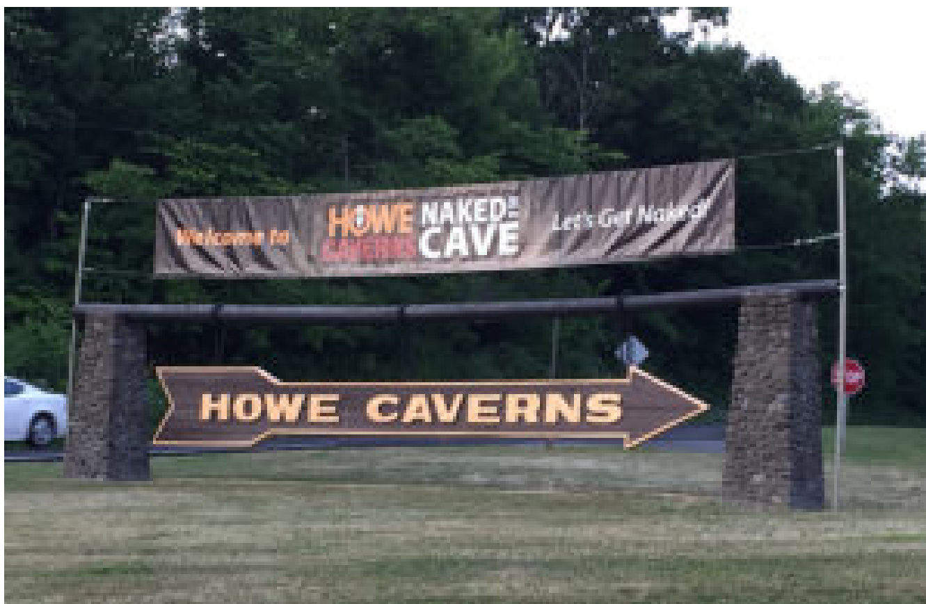
Howe Caverns "Naked in a Cave" entrance banner saying "Let's Get Naked!"